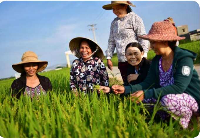
Photo: Women-led SRI field in Phuoc Thang commune, Binh Dinh is an initiative and success of Women Union of Binh Dinh province that creates strong base for cooperation between Women Union and Agriculture sector for disseminating and up-scaling sustainable rice production model in provinces.

Women are trained to be capable in applying technology, in managing the community tasks, and organisational missions. Women’s capacity development is indicator of political and socio-economic development of the country.