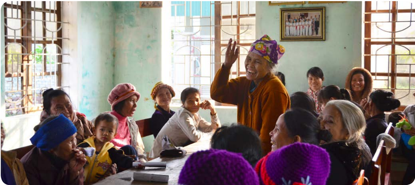
Photo: Women, especially those who are most vulnerable, are encouraged to participate in all project period and activities, playing important role in decision making of agriculture production, community agenda and project assignment. This creates evidences and motivations for women to participate and take roles in decision making process at broader scope of community life.

Women’s voice heard and image respected is result of long and meaningful process of community awareness raising and advocacy, as well as active participation and capacity development of women.