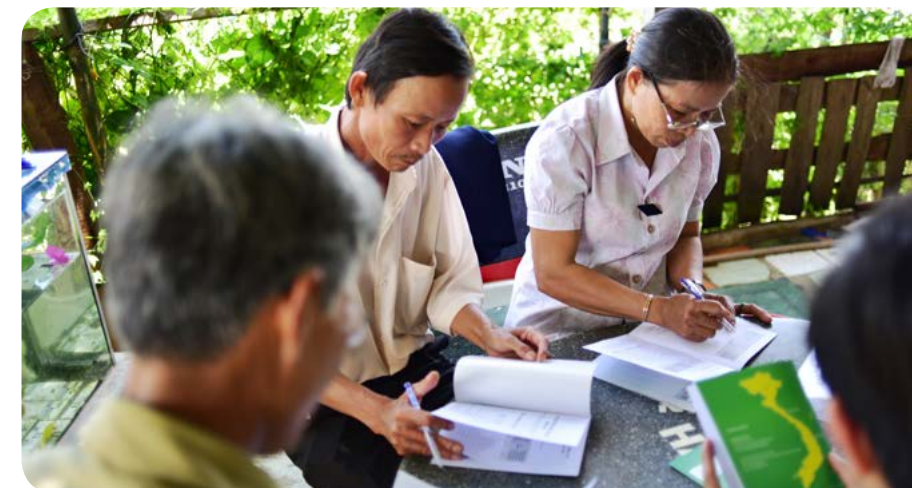
Photo: Farmers review SRI/VietGAP logbook

Women are key factor to make Hoai My cooperative a successful pioneer of promoting a model of combining Inclusive business and Market linkages with certification in rice production. The SRI rice of Hoai My cooperative with VietGAP certification has reached international market, bringing greater benefit for poor farmers in disaster prone commune