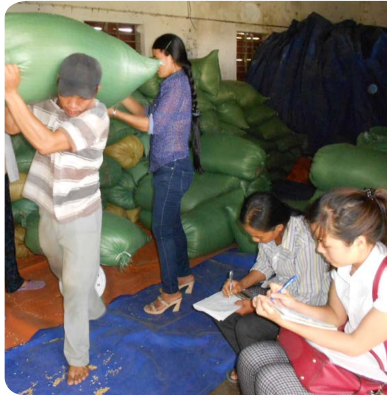
Photo: Rice storing at Thong Nhat Cooperative, Quang Binh - High number of women playing leading role in Farmers Group in Quang Binh and proving great success in operation.

National and local plant protection system is a technical implementation partner of SSC project. District Plant protection centers are the most direct technical provider to farmers via Farmer Field Schools and field services. Farmer Field School (FFS) is special effective and friendly capacity building progress for farmers – hundreds of Farmer Field Schools have been undertaken in framework of the project. A number of women of the system are taking leading roles in FFS, and later become recognized leaders in organisations.