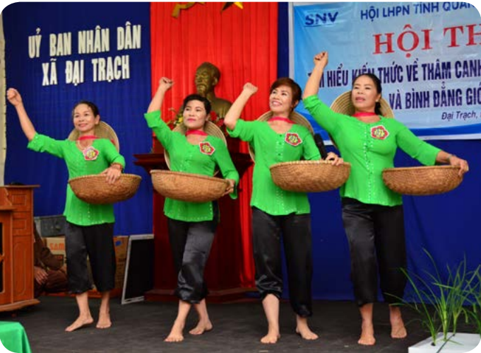
Photo: Contest on SRI farming technique and Gender equality, Dai Trach commune, Quang Binh province. The combined events “SRI and Gender equality” were intensely organised and led by Women Union in all project communes in 2 provinces, bringing great impacts of raising knowledge for both women and men on gender equality, agriculture and health, family caring etc. and smiles for villagers, authorities, men and women in community.

Women are trained to be capable in applying technology, in managing the community tasks, and organisational missions. Women’s capacity development is indicator of political and socio-economic development of the country.