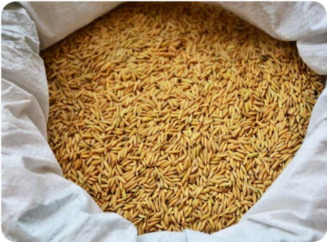
Photo: Active learning and applying SRI - advanced low inputs/low risks/low carbon farming techniques and values added of market linkage intervention bring remarkable income increase for male and female farmers.