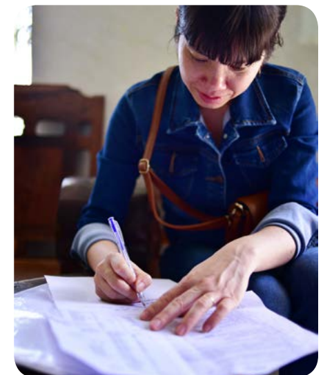
Photo: Women's talent in financial management - A financial controller of My Loc Thuong cooperative, Quang Binh province - a top successful cooperative in SSC project.

Women are key factor to make Hoai My cooperative a successful pioneer of promoting a model of combining Inclusive business and Market linkages with certification in rice production. The SRI rice of Hoai My cooperative with VietGAP certification has reached international market, bringing greater benefit for poor farmers in disaster prone commune