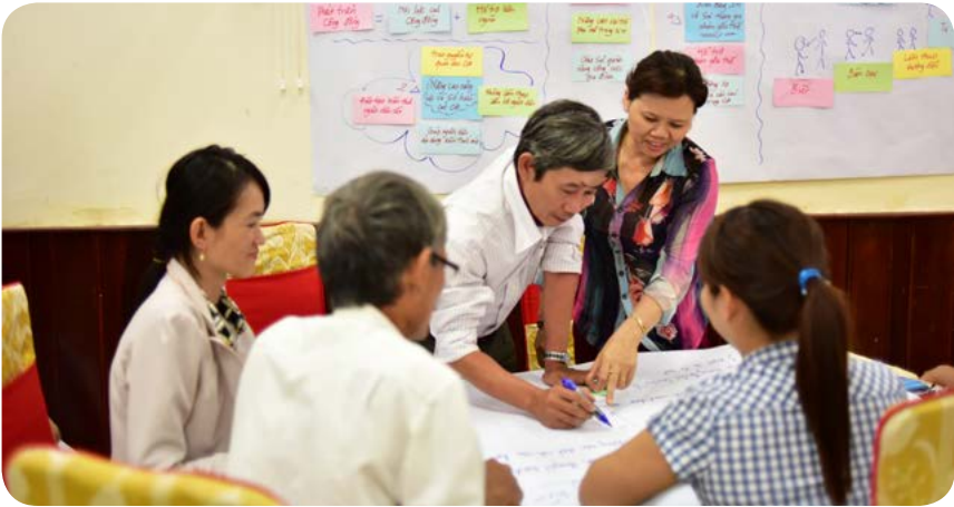
Photo: Community development dialogue in project areas.

Women’s voice heard and image respected is result of long and meaningful process of community awareness raising and advocacy, as well as active participation and capacity development of women.