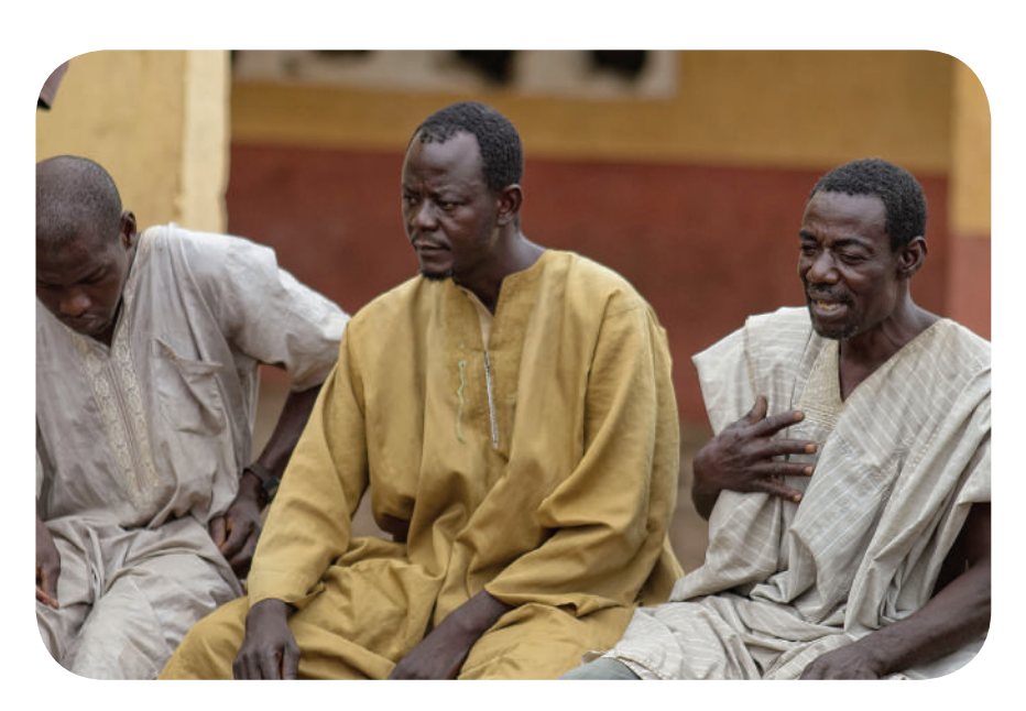
Matchmaking events allow farmers the opportunity to learn about the SF market

The farmers explained how their larger FBOs are divided into 72 small member organisations spread over the area, which was important for the caterers to understand since one of their challenges—and a goal they wanted to address—was lowering transportation and handling costs. Based on this