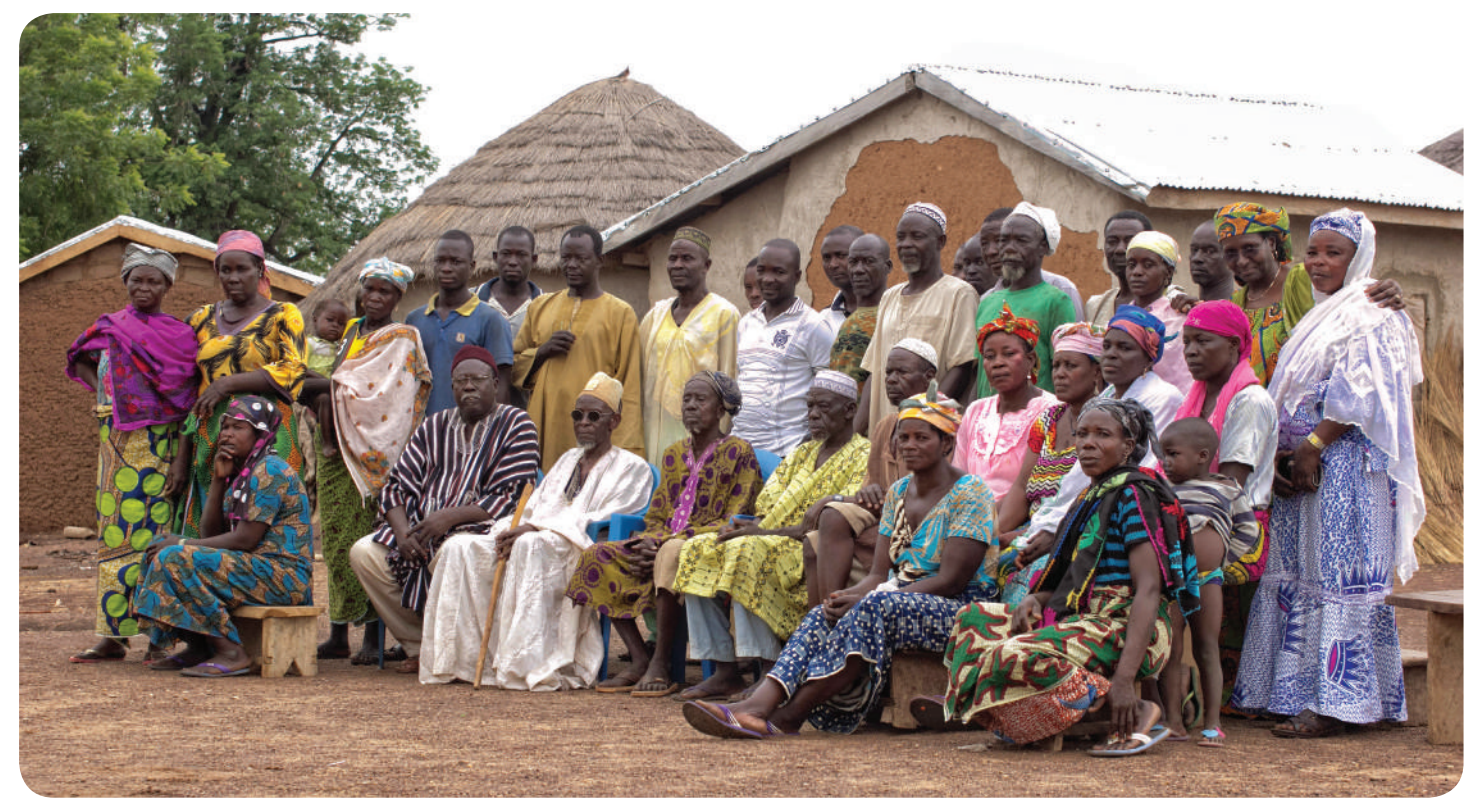
Farmer and caterer meeting near Karaga

their ability to enter into successful business transactions: FBO production, storage, aggregation, and marketing capacity; access to credit for both caterers and growing FBOs; and business skills. Other factors—such as the delays in funding for school feeding and the caterer model of pre-financing—represent formidable barriers to sales between caterers and farmers. Matchmaking events in Ghana foster a dialogue on these issues, empowering participants to reflect on the organisation of their own businesses and providing a venue for supply- and demand-side actors to devise mutually agreeable solutions to facilitate commercial transactions.