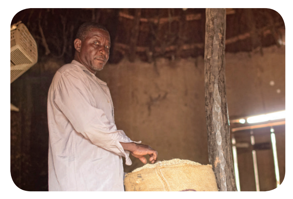
A farmer inspects his unmilled rice

investigates the MOUs that did not result in commercial transactions, to determine the reasons they were not implemented and to discuss potential solutions. Participants then have an opportunity to renew their MOUs, or develop new partnerships. FBOs and caterers make adjustments based on current needs, and incorporate the availability of new foodstuffs, volume and price adjustments, as well as any changes to payment terms. Of the four districts where SNV piloted matchmaking events in 2013, over 80% of participants renewed their MOUs in July 2014, which will be valid through July 2015.