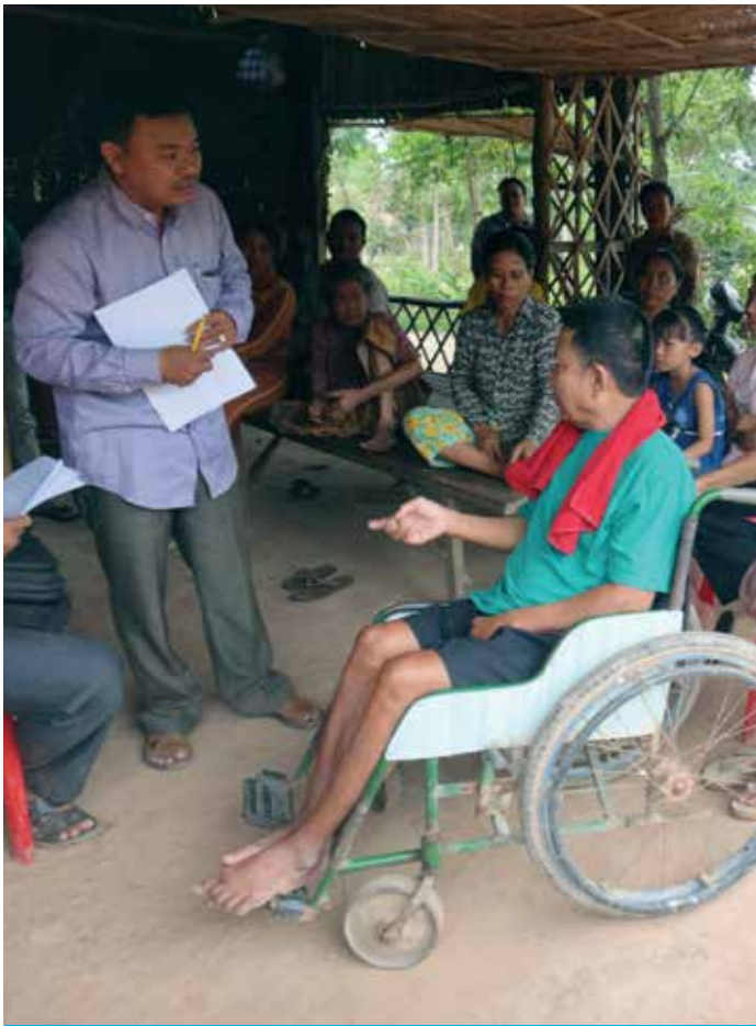
SNV in Cambodia: Sanitation planning activities with PLWDs