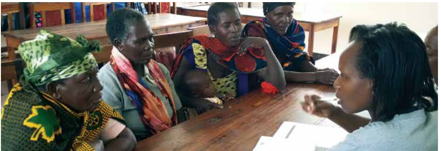
SNV in Tanzania: SNV advisor in discussion with female household heads in Chato district to establish how they have benefitted from the project