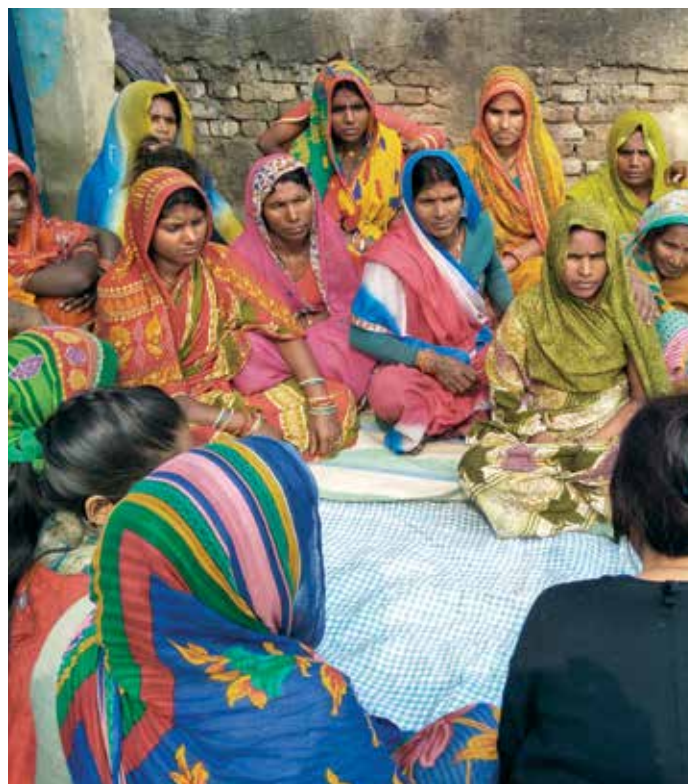
SNV in Nepal: Formative research with Dalit women on hygiene behaviours in Mansighpatti, Dhanusa