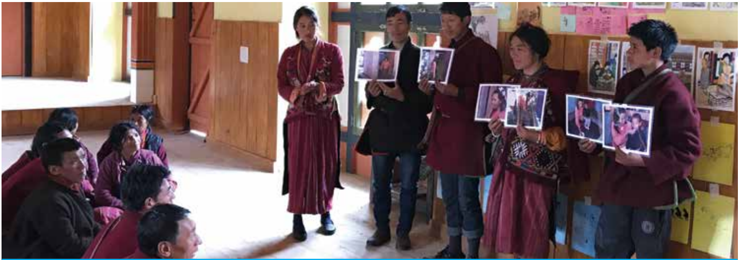
SNV in Bhutan: Tailored triggering activities engaging women and men