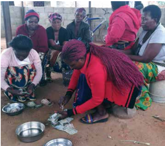
SNV in Zambia: Members of the Lua Luo sanitation marketing micro financing committee mobilising savings from members

This research found that the 'last mile' differs across programme locations, comprising a mixed group of people, and that affordability should not be assumed as the main barrier for access to sanitation.