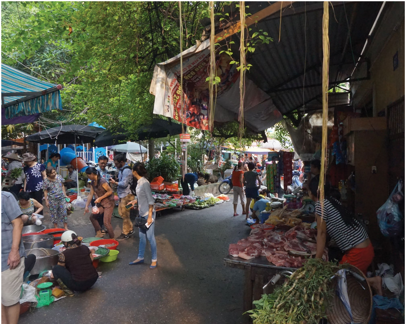
A neighbourhood market in Hanoi

The exploitation of 'grey areas' by officials is at its strongest with street vending, especially of prepared food. Vendors must manoeuvre to survive in a city that is often inhospitable, such as in Dhaka (Lata 2020). They may face repression and harassment, bribery and extortion, the threat of arrests and fines or the confiscation of goods. They may see no provision of services in return for market fees, and food safety may be compromised not by the vendor but by the environment in which they — or their suppliers — work. Resistance to informal trading may also come from formal traders and shopkeepers. But it is also common to see tolerance of informal vending by local governments, either due to lack of resources for policy implementation, political reality, compassion or an informal exchange of some political protection for election support, as reported in Kampala (Young