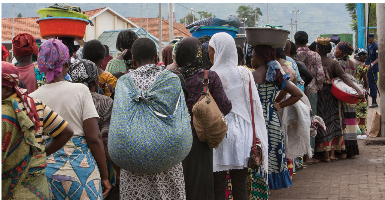
Cross border traders in Rwanda

Informality is also a common feature of cross-border trade which is important in mitigating food supply gaps for vulnerable populations and providing employment, especially for women (UNCTAD 2019), and generating income in border areas. Informal cross-border trade accounts for 30–40% of intra-Africa trade in the Southern African Development Community (SADC). An example is the Mwami–Mchinji border between Zambia and Malawi, where informal trade is mainly of unprocessed food staples, 75% of which is conducted