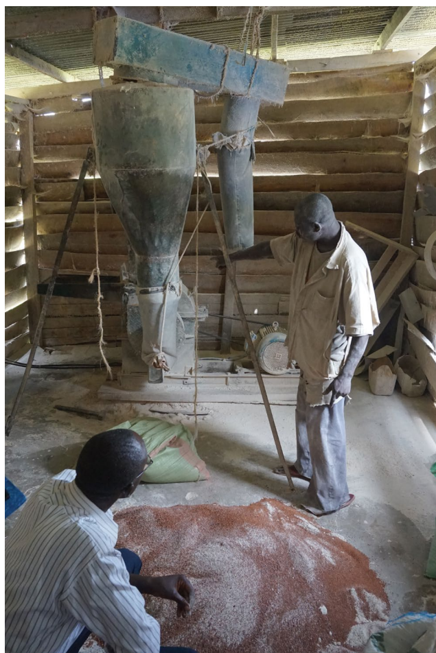
A small and medium-sized food processor in Fort Portal, Uganda

Much primary processing in low- and middle-income countries (such as milling cereals, butchering animals, drying vegetables, extracting vegetable oils and smoking fish) is done by informal or unregistered SMEs: 80% in sub-Saharan Africa (Diao et al. 2018) and 98% in India (Ministry of External Affairs, Government of India 2020). These enterprises are often situated in towns and villages in rural areas. They are important mechanisms for developing domestic agricultural markets, as well as drivers of rural economic diversification and a major source of rural employment. However, some sectors (such as milk pasteurisation) are typically more concentrated and dominated by formal industries. The same can be said of ultra-processed food and drink, so critical in driving the 'nutrition transition' 2 and marketed in low-income communities through 'base of pyramid' strategies via informal vendors.