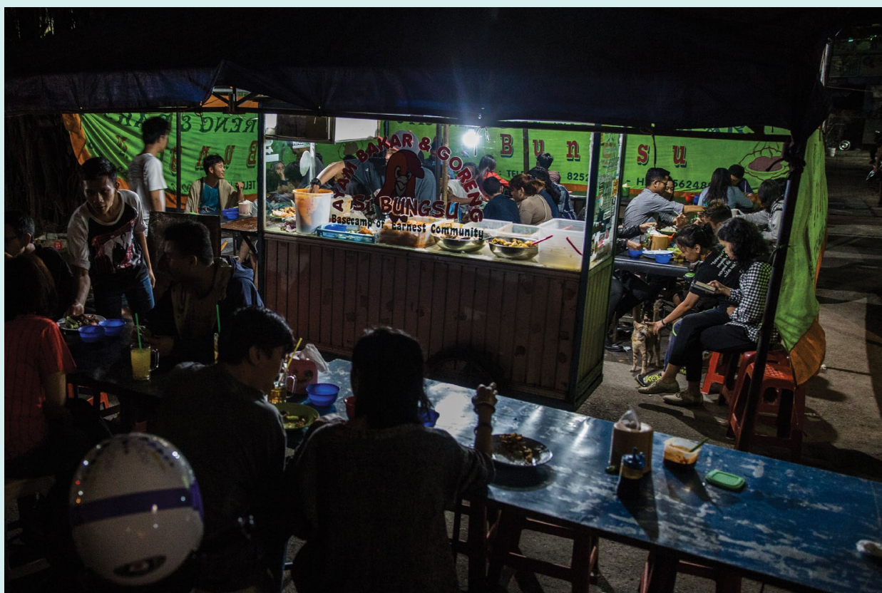
A busy street vendor in nighttime Bandung