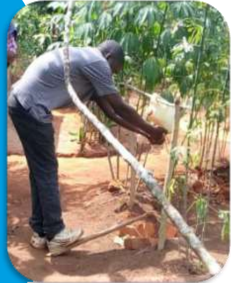
A foot operated tippy tap in a rural setting in Uganda

Tippy taps are the most commonly used handwashing technology in rural Uganda, and are generally homemade. These facilities have a shop-bought bar of soap attached or liquid soap added to the jerry can of clean water. A few households make their soap from materials such as potash (potassium ash made from banana peel ash), vegetable oil and water.