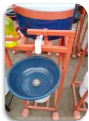
An example of push shower taps