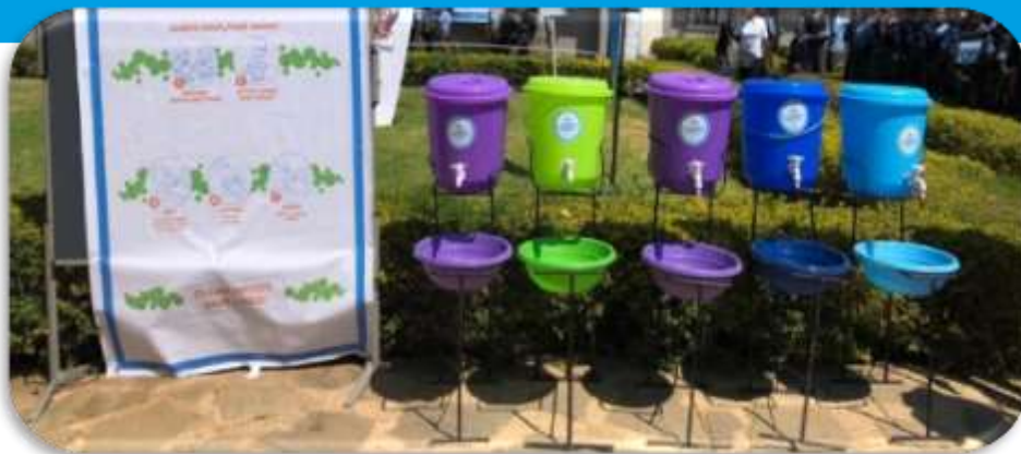
Kalingalinga handwashing station in Zambia

The Kalingalinga model used in Zambia is an older design from which Kokola derives. Notable differences between Kokola and Kalingalinga include the use of plastic versus metal buckets and the relatively lighter frame of the Kalingalinga system. In all other regards the two types of handwashing station are the same.