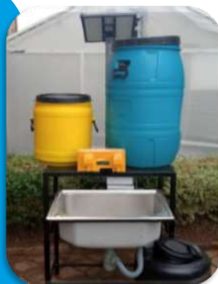
A solar-powered hands-free handwashing dispenser in Uganda

The dispenser is fitted with motion sensor technology, a water container, and a power source (in this case for solar power). It discharges water immediately when one moves their hands closer to the tap, thus minimising contact with potentially contaminated surfaces. It costs Ush 120,000 (US$ 33) to produce one motion sensor unit and Ush 500,000 (US$ 135) to produce an entire handwashing station. This is affordable for most local authorities but may be unaffordable for household premises.