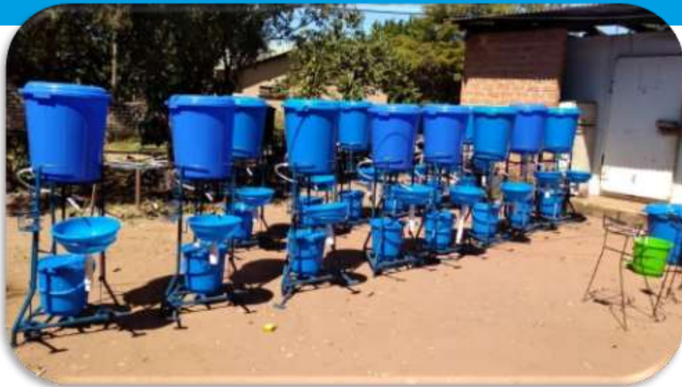
Foot operated handwashing facility developed by local entrepreneurs in Zambia