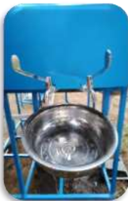
An elbow press mechanism