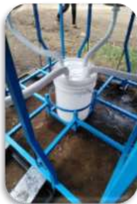
Grey water storage container