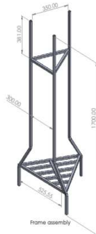
Assembly of 20-60 litre metal frame for foot operated washing station 5