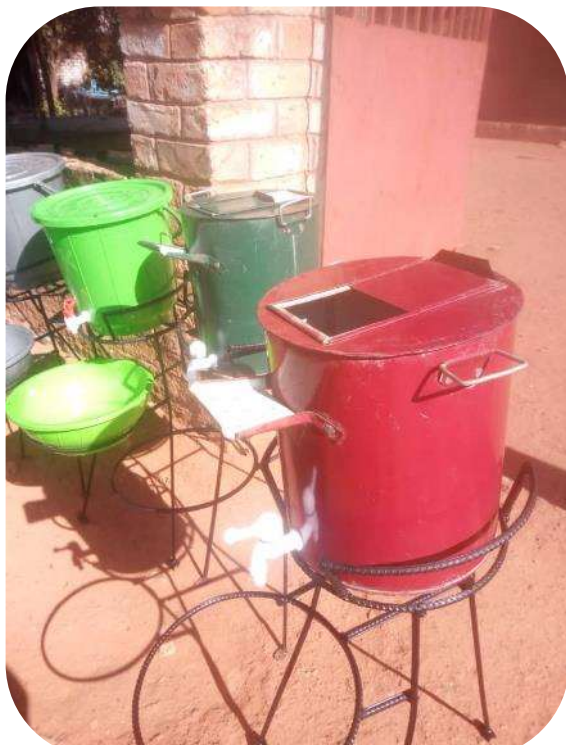
A Kokola handwashing station in Zambia