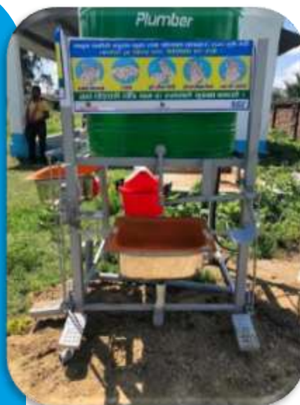
Handwashing station in Nepal. Installed in Health Care Facilities in Khadak Municipality.

The stations have been designed to be user friendly and accessible. While the able-bodied use a foot pedal to operate the taps and soap dispenser, the less able (such as children, elderly people, pregnant women, and people with disability) can use a hand lever. The stations include water tanks with capacities of 200-500 litres, depending on need.