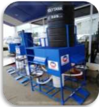
Example of a foot operated handwashing station in Tanzania: 225, 60 and 20 litre capacity