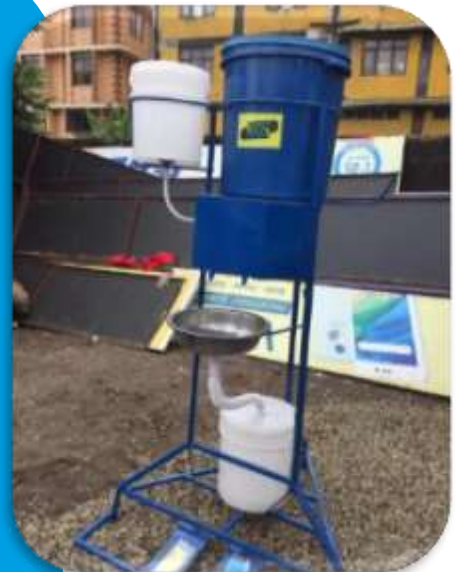
A 60-litre foot operated handwashing station in Arusha, Tanzania

The system has five main parts: 1) a clean water storage tank, 2) a soap storage container, 3) a grey (used) water storage container, 4) a frame/tower that is stable enough to hold the required containers, and 5) the operating system (made of a foot pedal and clutch cables for this particular design). The system is available in different sizes depending on needs. Stations with 20-60 litre capacity are mostly used in offices and premises preparing and serving food, and stations with 60-250 litre capacity are used in public spaces.