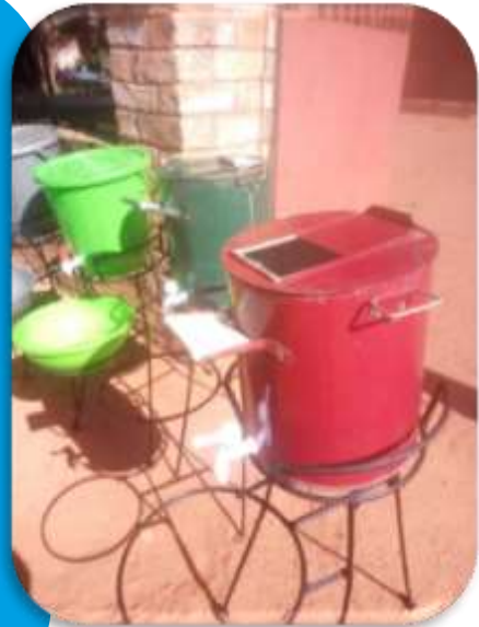
Kokola handwashing station in Zambia

The stations consist of a water storage bucket made from new or used metal sheets, a basin and tap dispenser and a frame. The handwashing stations are for use by adults and children of a certain age. However, they are not so easy to use for people with certain disability.