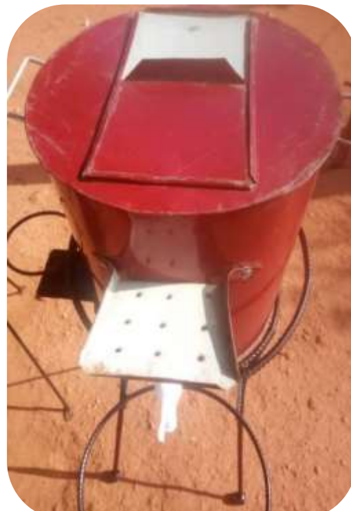
Perforated soap tray